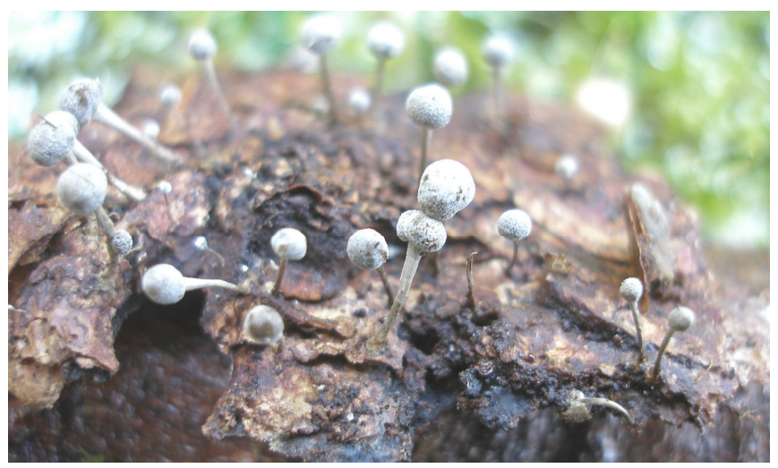
fig.26 When is a Slime Mould not a Slime Mould? The fruit bodies. (PC)

During our discussions at the time Derek mentioned that he recalled a species which looked exactly like a Slime Mould but was in fact completely unrelated, being a fungus (myxos are in fact not true fungi at all but form part of Mycetozoa ,