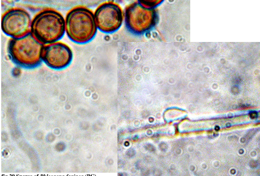
fig.29 Spores of Phleogena faginea (PC)

Penny found these rather fine specimens of Cortinarius torvus (Stocking Webcap) on 29 Sep 2011 at Burnham Beeches (fig.21), of a tiny, pure white Amanita species on 10 September 2011 at Kings Wood (fig.22) and of an unidentified Cortinarius species on 25 August 2011 at Stoke Common (fig.23).