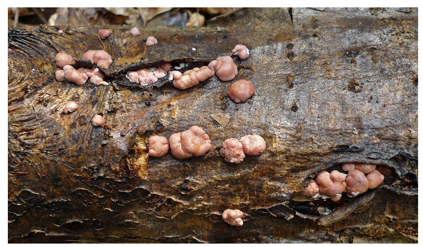
fig.17 Hypocrea on fallen branch at Hockeridge Wood 11 Mar 2012

and collected it and started an initially inconclusive debate about what tree the branch might have fallen from (fig.19). Hypocrea species are Ascomycetes that have an alternate (anamorph) Trichoderma form sometimes growing with them,– a powdery green mass – a fact which I knew but had forgotten. Fortunately, this was recognised by Anthony Burnham, allowing me to photograph it (fig.18) and collect a sample for study at home along with the pink mounds, which are referred to as the holomorph or perfect stage, producing the Ascospores that result from two individual fungi mating.