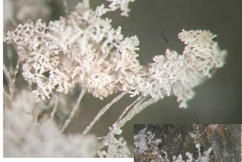
fig.12 Chromelosporium ochraceum from Sandwich Wood 29 Oct 2011 – the scale in the lower right hand photo is millimetres (DJS)

At Hampden Common in the afternoon, the cricket pitch being shown once again to be one of the more outstanding patches of unimproved grassland in the County, with no fewer than eleven Waxcap species, Hygrocybe including calciphila (a red data list, near threatened species), fornicata (Earthy Waxcap), pratensis (Meadow Waxcap, fig.13) and reidii (Honey Waxcap) as well as four Clavulinopsis species.