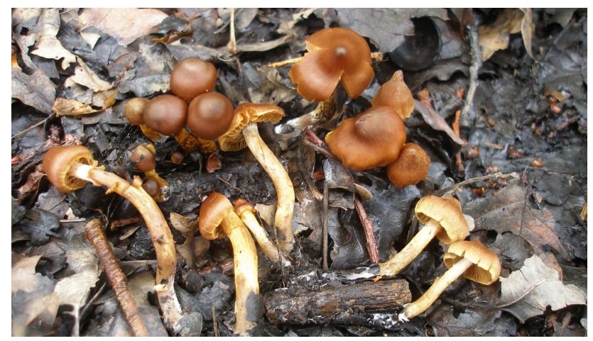
fig.23 Cortinarius sp. Stoke Common 25 Aug 2011 (PC)