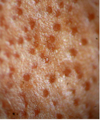
fig.20 Hypocrea minutispora under the dissecting microscope (DJS)