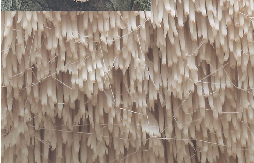
fig.34 Hericium erinaceus 10 Dec 2011 about 30 cm from top to bottom with close up of spines below (PD).

The Naphill fruit body grew very slowly over the next month as can be seen from the photograph taken on 10 December (fig.34). By 30 December (fig.35), the colour was changing to vellowish. darker in places and this was very clear by 5 January 2012 (fig.36). By 14 January 2012 the specimen started to come away from the main body of the tree on a 'stalk' which can be easily seen in the photograph taken 29 January (fig.37).