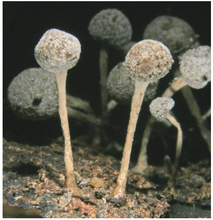
fig.28 Fruit bodies viewed through the dissecting microscope (DJS)

Under the scope I found the typical tight mass of round spores seen in most Slime Moulds; they were entirely smooth, pale brown and measured around 6-9 microns across (see fig.29). The shape of the fruit bodies suggested to me the genus Physarum or Didymium , but any likely candidates had spores which were either bigger or ornamented, and also as I'd suspected when I first saw our collection the specimens were too big. I found one further clue which also put a spanner in the works: there appeared to be long thin cylindrical cells (hyphae) which were clamped, i.e. had a kidney-shaped extension linking the two cells, giving each section the appearance of a dog bone (see fig.30). As far as I knew this never occured in Slime Moulds, nor in Ascomycetes , so this surely had to be some strange form of Basidiomycete ?