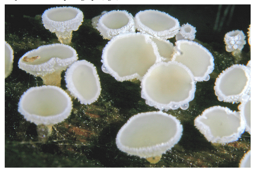
fig.1 Lachnum niveum, Carpenters Wood 9 Jan 2011 - the larger disc in the foreground is 1.8mm diam (DJS)

In the absence of Kerry Robinson, our list of 49 species, whilst creditable enough for an icy January day, lacked some of the rarities Kerry so often finds. Exidia plana (see web site report for Hockeridge Wood 2012 for photographs), probably the species on our list with fewest previous records, is recorded more often than in the past now that Peter Roberts' keys to jelly fungi have clarified its differences from Exidia glandulosa . Other species included Peziza micropus , Xylaria carpophila (Beechmast Candlesnuff), Byssomerulius corium (Netted Crust), Trichia affinis (a Slime Mould) and Lachnum niveum , which provided a good subject for a micro photograph (fig.1).