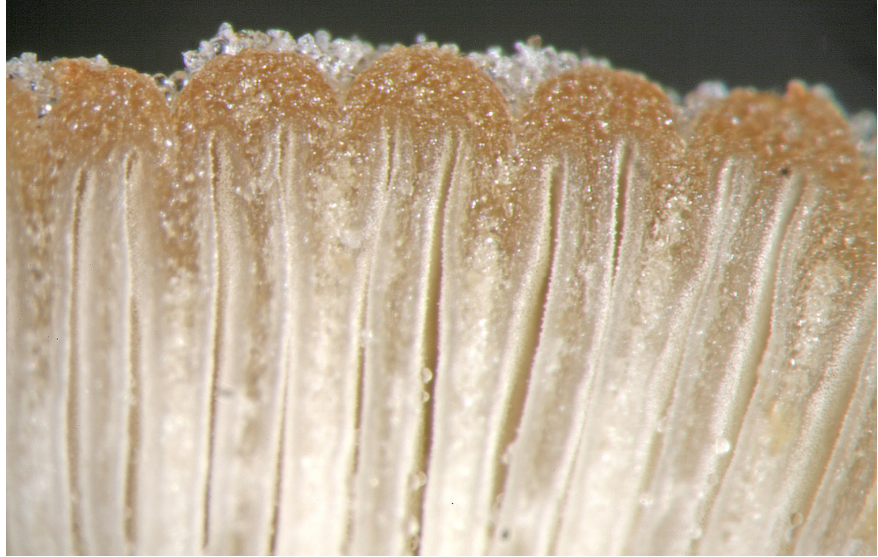
fig.3 Coprinellus micaceus, Stoke Common 29 May 2011 - cross-section of young cap

cells, can be seen on the outer surface of the cap. Cystidia are beginning to emerge from the gill face, which is still pale because the basidia have yet to mature and produce the dark spores.