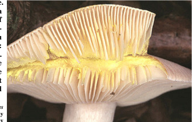
fig.42 Lactarius chrysorrheus

subject for another time. Let me finish with a favourite epithet of Derek's, selfexplanatory if you know this species: Lactarius chrysorrheus . The genus name I have already covered. The species name? "That which lets the gold flow".