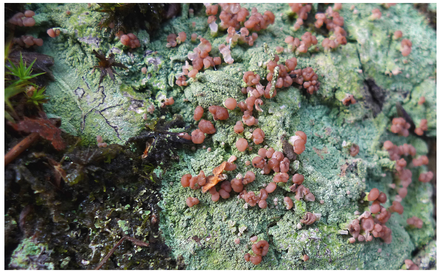
fig.11 Baeomyces rufus, a lichen, at Sandwich Wood 29 Oct 2011 (DJS)

fig.10 Mutinus caninus found at Ashridge 23 Oct 2011; this specimen photographed at Pulpit Hill in 2009 (NS)