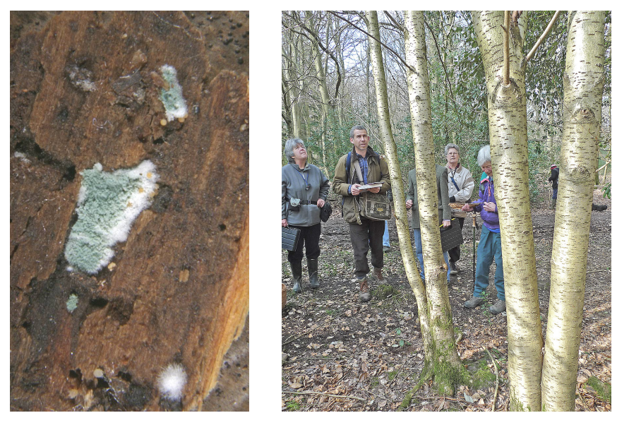
fig.18 Green Trichoderma stage (DJS)