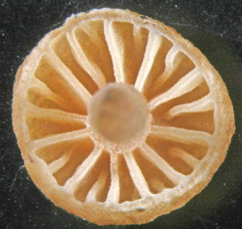
fig.2 Galerina subclavata Hockeridge Wood 13 Feb 2011 -the cap is about 4.5mm diameter (DJS)

wood) such as Panellus stipticus (Bitter Oysterling) which glows in the dark if you find it in North America but not in Europe, Crepidotus cesatii and Crepidotus variabilis (Variable Oysterling). Jenny Schafer collected a single tiny Galerina growing on moss, which, against the odds had a rather distinctive set of microscopic characters allowing it to be named as the rather uncommon Galerina subclavata (fig.2)