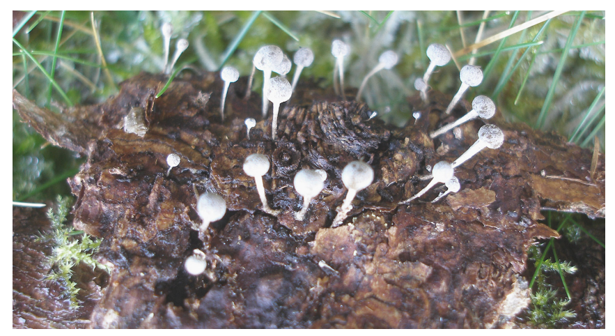
fig.27 When is a Slime Mould not a Slime Mould? The fruit bodies. (PC)

During our discussions at the time Derek mentioned that he recalled a species which looked exactly like a Slime Mould but was in fact completely unrelated, being a fungus (myxos are in fact not true fungi at all but form part of Mycetozoa ,