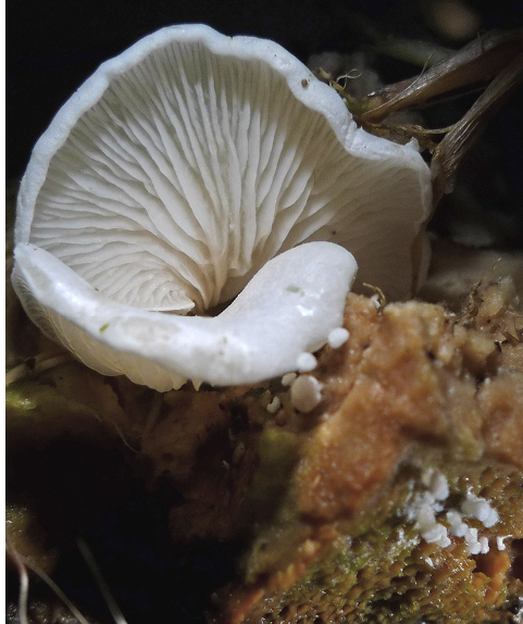
fig.15 Clitopilus hobsonii from West Wycombe Hill 6 Nov 2011, growing on old fruit bodies of Trametes versicolor (DJS)

A cold November day produced a list of 36 species from this site which is new to the Group. Finds included an Agaricus , along a path with Yew, that keyed out to Agaricus gennadii , although the fruit bodies were rather young, leaving some doubt about the identification. A collection of Clitopilus hobsonii (fig.15) was growing on very old fruit bodies of another fungus, Trametes versicolor .