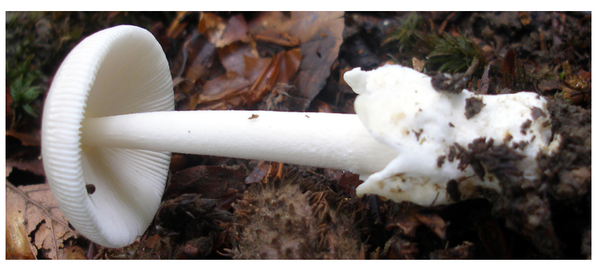
fig.22 Amanita sp. Kings Wood 11 Sep 2011 (PC)