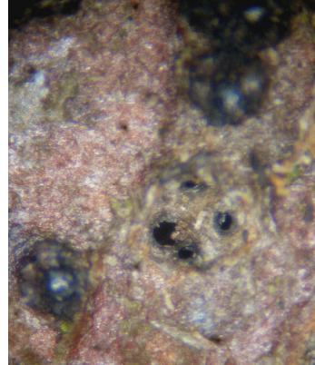
fig.24 Black dots on sticks collected at Hockeridge Wood March 2012, determined as Quaternaria quaternata (PC)

black crusty gunk one spore! As with swallows and summer, one is not enough to make a determination, so I ploughed on with the decapitation till I eventually struck lucky. Though I could find no signs of an ascus (the typically long and thin, spore-containing sausage which characterises Ascomycetes ), one preparation revealed abundant spores thankfully proving that the singleton I'd spotted earlier