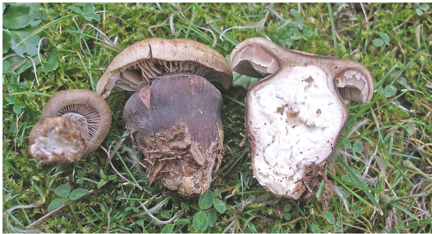
fig.40 An identification challenge (PC)