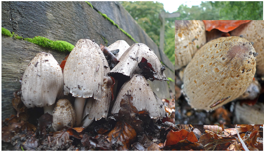
fig.8 Coprinopsis romagnesiana in the White Cross car park near Cadsden 9 Oct 2011 (DJS)

Roger Kemp led us around some of his favourite wildlife spots in the Cadsden and Brush Hill area. By this time the season was providing much reduced amounts of fungi fruiting and a hard-won list of 29 species was eventually produced, including Clitocybe houghtonii , Stropharia aeruginosa (Verdigris Agaric) and, growing on the wooden sleepers in the car park, Coprinopsis romagnesiana (fig.8).