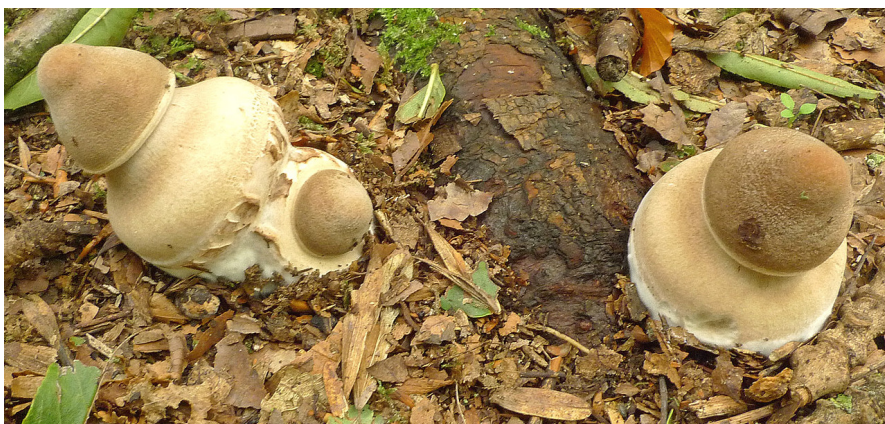
fig.5 Immature stages of presumably Chlorophyllum olivieri Ashridge 10 Sep 2011 (DJS)