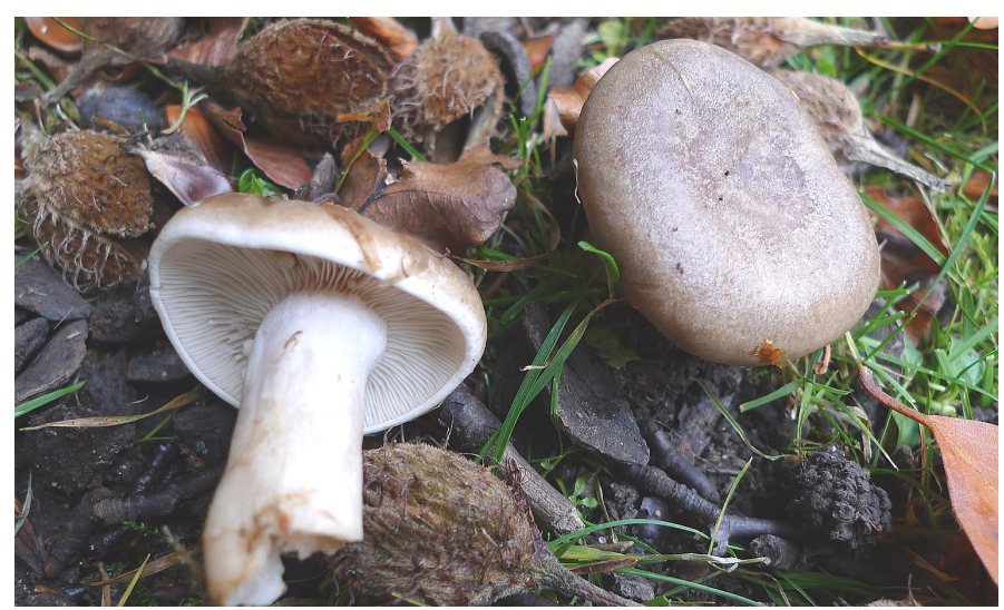
fig.14 Lactarius fluens Hodgemoor Woods 30 Oct 2011 (DJS)