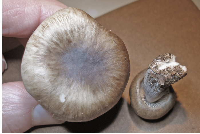
fig.41 An identification challenge

recognised it instantly and came straight back with the answer, which the microscopic characters then confirmed. He had seen similar strangely deformed specimens of this very common woodland species before, but can you guess what it is?! (Solution on page 39).