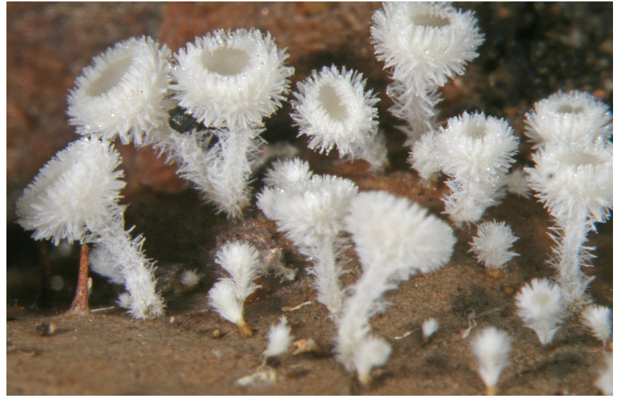
fig.16 Lachnum virgineum found at Carpenters Wood 15 Jan 2012 on Beech – this specimen is from the Forest of Dean in April 2012 and is growing on Bramble – the size of the discs can be judged against the thorn to the left of the photo (DJS).

Our first foray of the 2012 season produced a list of 55 species, many of them crust fungi on wood, small Ascomycetes , such as Lachnum virgineum (Snowy Disco, fig.16), small Myxomycetes and one small thing looking like but not a Myxomycetes (see Penny's article below on p.22). A number of gilled agarics, such as Pseudoclitocybe cyathiformis (The Goblet), Crepidotus luteolus and Phaeogalera dissimulans (also known as Pholiota oedipus , Meottomyces dissimulans and many other things – basically no one knows where to put it).