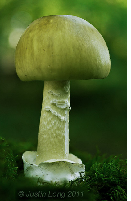
fig.31 Amanita phalloides (Death Cap) (JL)

An influential 1991 article in the Classical Quarterly suggests that Claudius was killed by Amanita phalloides , the appropriately named